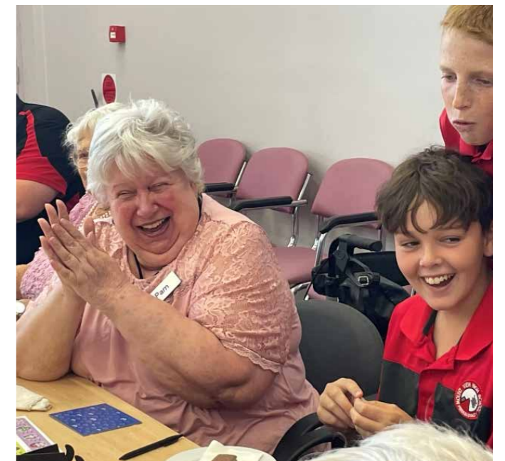
Mt View High School