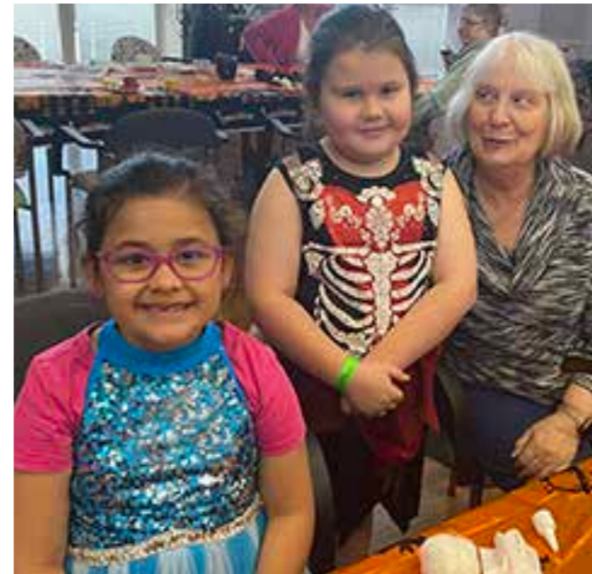
St Nicholas OOSH

In the heart of these initiatives lies the essence of our commitment – to create moments of connection that last a lifetime. We extend our deepest gratitude to all the students, teachers, and community members who have played a role in making these programs a success. Together, we are building bridges, creating memories, and spreading joy. Let's continue to connect, inspire, and uplift each other as we navigate this beautiful journey of togetherness.