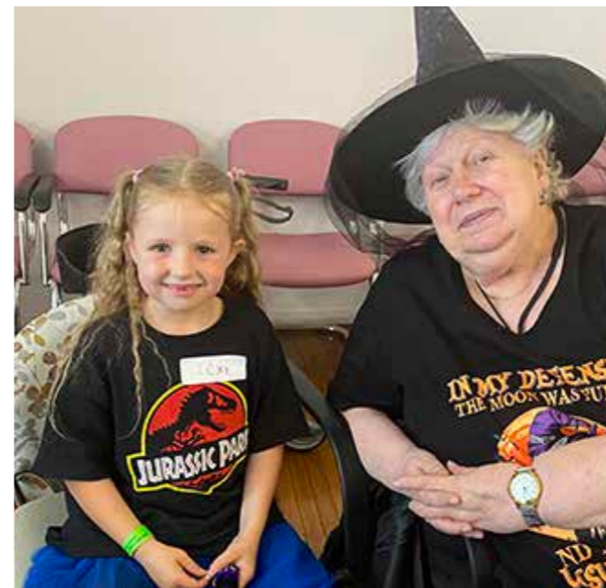
St Nicholas OOSH