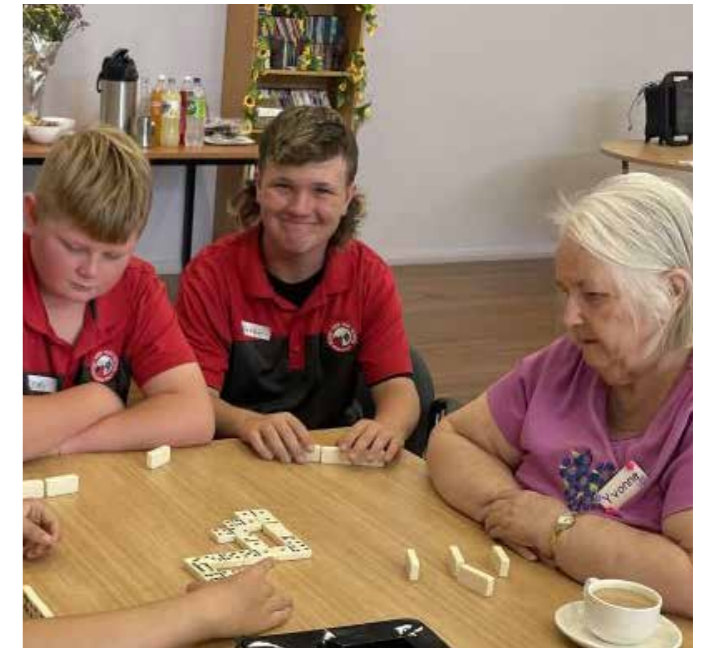
Mt View High School